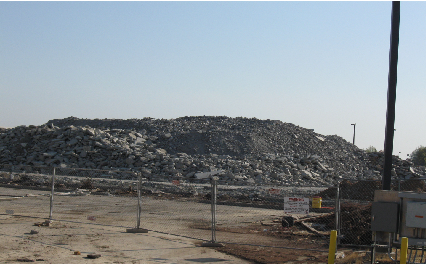
This picture of Building 628, Western Field Office - 1155 Tech Ops Squadron - Technical Operation Division was taken on 16 September 2008.