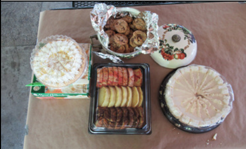
Great desserts too!