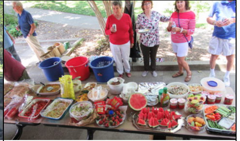
Some great potluck dishes!