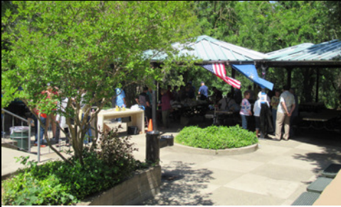
A nice place for a picnic & a beautiful day too!