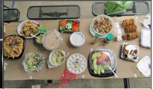
Some of the delicious pot-luck dishes