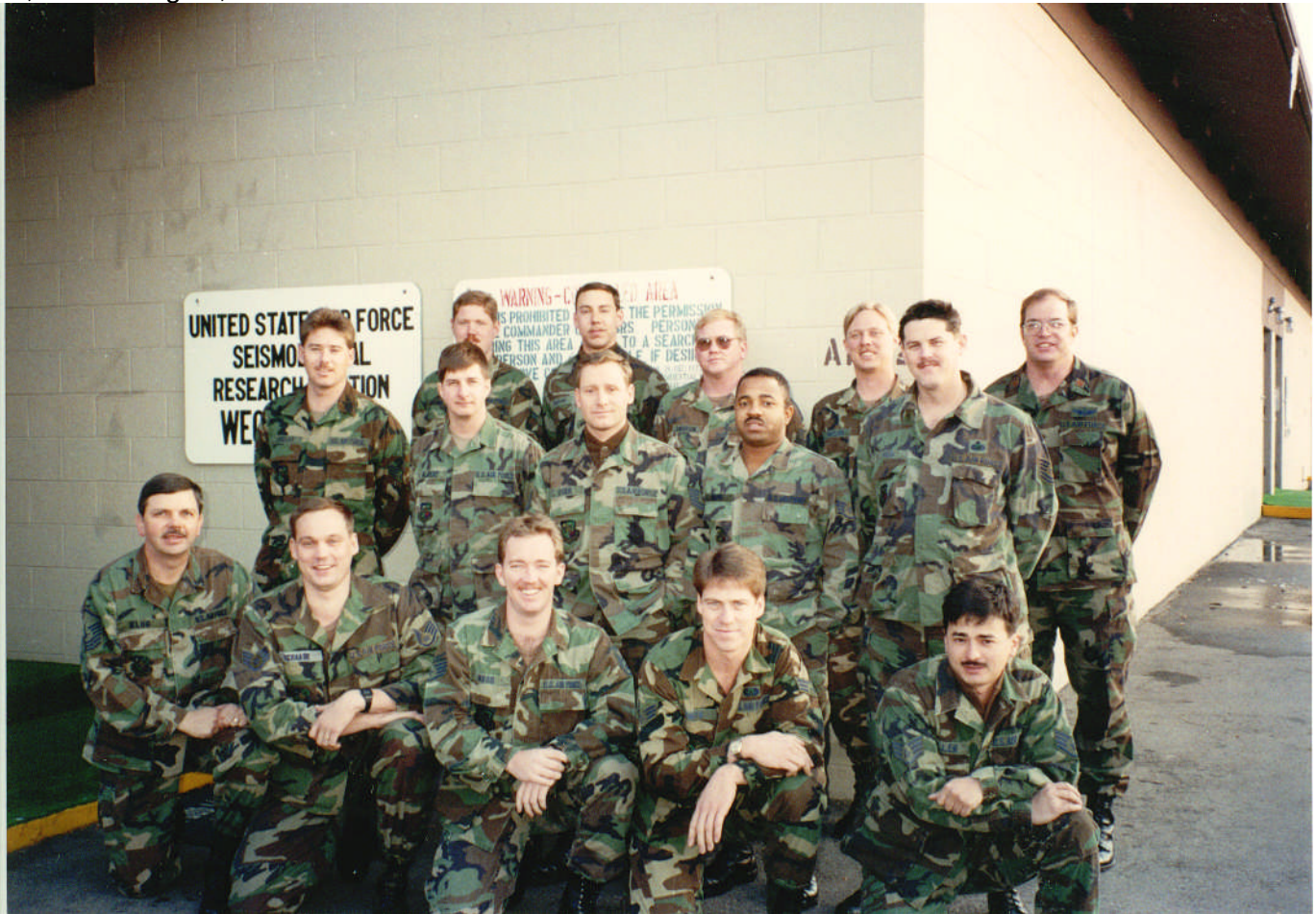
Detachment 452 – 1990 (Only AFTAC detachment to have 15 handsome men assigned at the same time)

We've started a series of articles called "WAY BACK WHEN". This will be patterned after the Florida Chapter's series in the Post Monitor called "B.S. (Barely Substantiated) TALES". We're inviting everyone to submit articles or pictures with stories from days-gone-by at Detachments, OLs, Depot, Squadrons, Headquarters or TDYs. Crank up your "WAYBACK machines" and send us an article. Remember to keep all the inputs unclassified. E-mail all proposed articles to me at: FalloutEditor@AFTACwest.org or snail-mail to: P.O. Box 3974, Citrus Heights, CA 95611-3974.