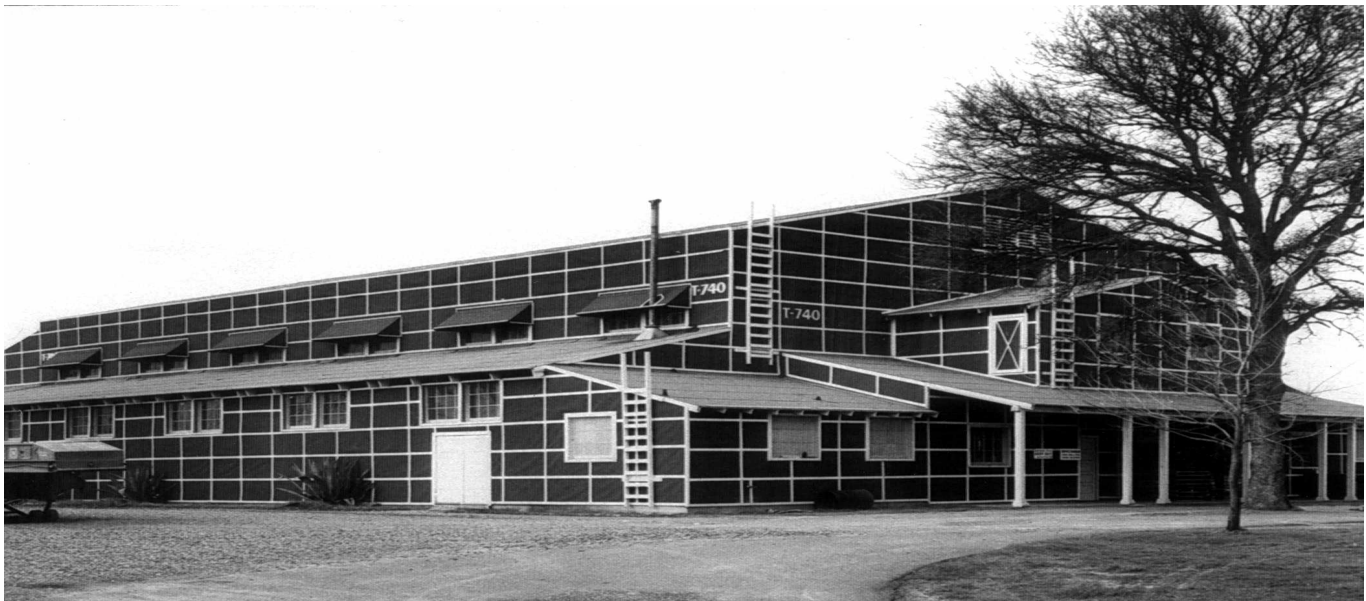
According to the "TOD Heritage Remembered" book, this was the old specialized depot building, T-740 at Camp Kohler