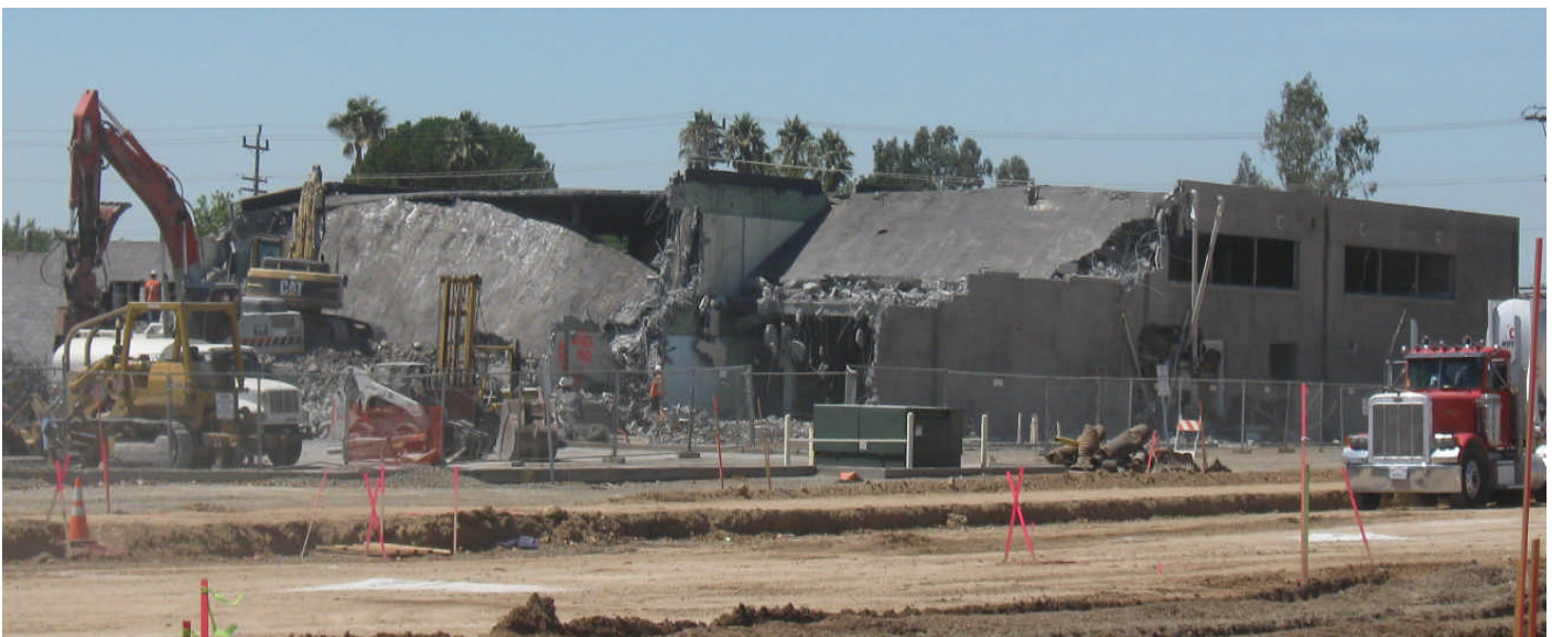
This picture of Building 628, Western Field Office - 1155 Tech Ops Squadron - Technical Operation Division was taken on 22 August 2008 by Dale Klug, newsletter editor.