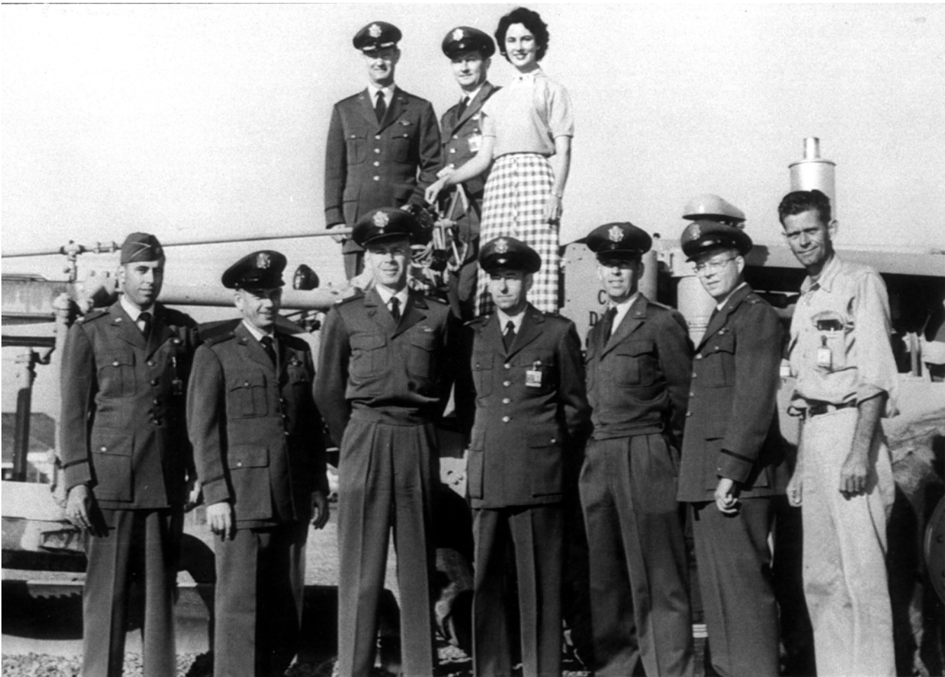
According to the "TOD Heritage Remembered" book, this picture is of the WFO, Building 628, groundbreaking in 1955