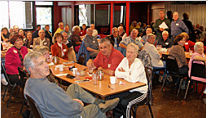
33 of the 42 WCC Members at the Luau Gardens Fall Social