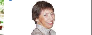
See more in full color at: www.AFTACWCC.org