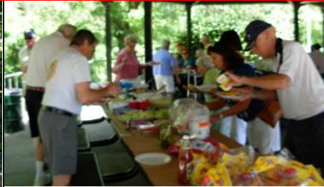
Lots of good food to share with good friends on a beautiful June day. It don't get much better!