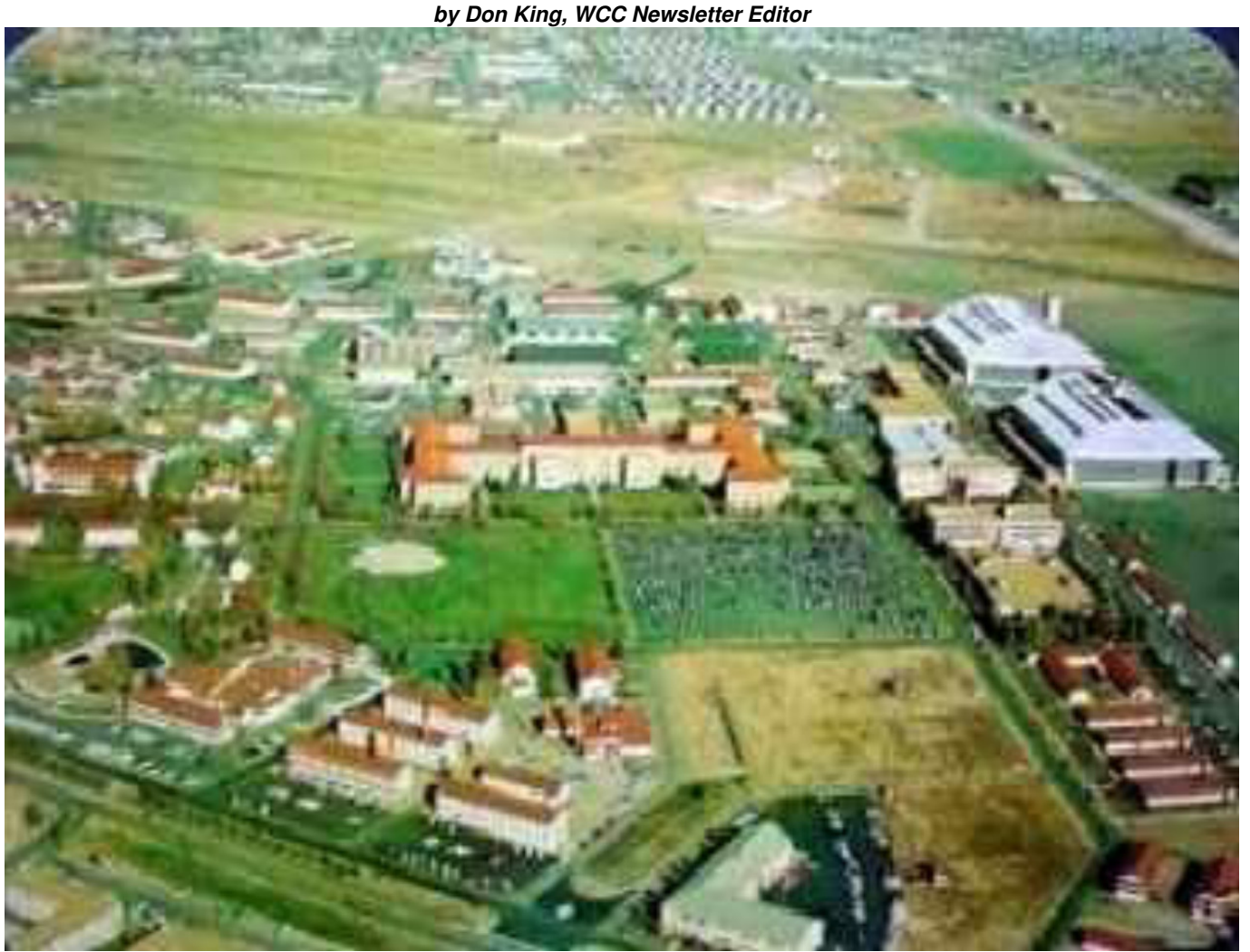
LOWRY AFB - 1950'S